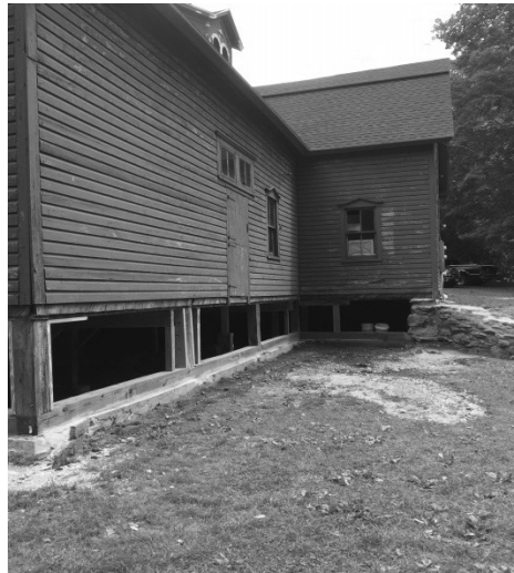
South Side - After

In August and September we hope to complete this phase of the restoration, including getting the cupola painted, all of the glass windows and doors sanded, repaired, and primed and completion of all the grading. During the winter the Barn committee will be preparing a plan for the Congregation to complete this project by residing the building and painting the building and replacing the driveway next year.