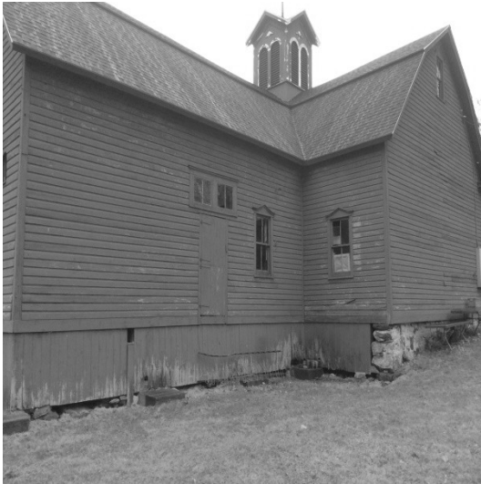
South Side – Before

With completion of the new roof and repairs to the cupola last year, this summer work Church House began on the next steps in renovating our CCB Barn. We are now replacing the sills at the rear section of the barn as we shore up our barn structure. This work involved lifting the barn, replacing rotted and water damaged wood, repairing collapsed foundation walls, and re-grading the yard around the Barn to improve drainage. As of August 1 st , this work was accomplished with the help of our own volunteers contributing more than 240 man-hours of labor, mixing in excess of 260 bags of concrete, and installing heavy 8x8 pressure treated beams and supports.